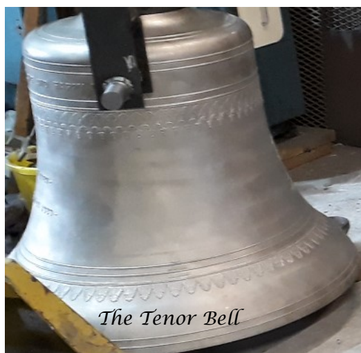
The Tenor Bell