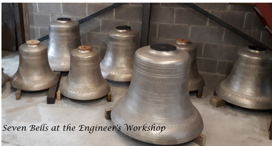
Seven Bells at the Engineer's Workshop